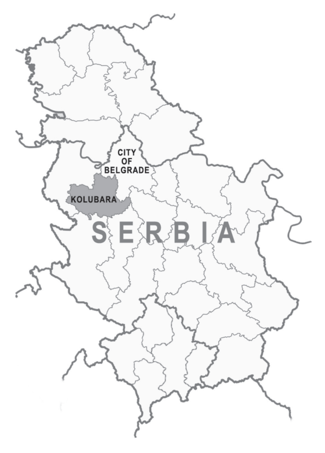
Fig. 1 Map of the Republic of Serbia and position of Kolubara district Slika 1. Karta Republike Srbije i položaj Kolubarskoga okruga

The soil analyses were first performed on the surface of energy plantation in order to obtain data on physical and chemical properties of the soil and soil type. Soil surveys were performed at three locations, and soil samples in the state of disorder were taken