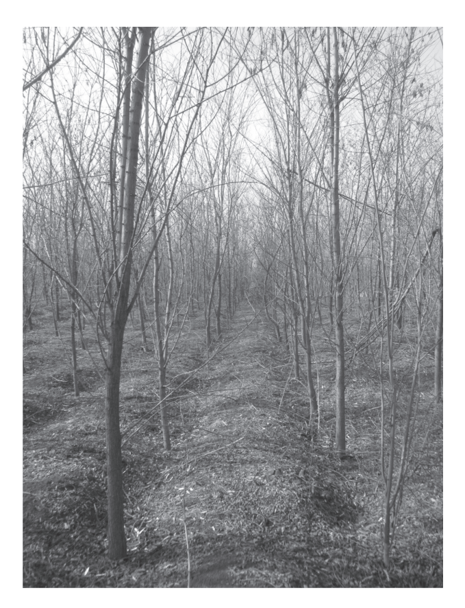
Fig. 2 Short rotation energy plantations of black locust on tailing dump of »Field B« open pit in »Kolubara« mining basin

Slika 2. Energetski nasad bagrema kratke ophodnje na odlagalištu »Polje B« površinskoga kopa »Kolubara«